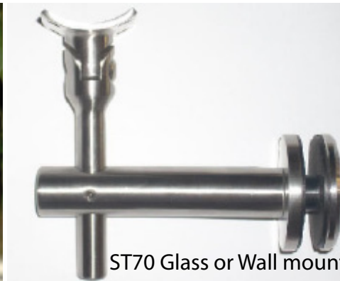
ST70 Glass or Wall mount