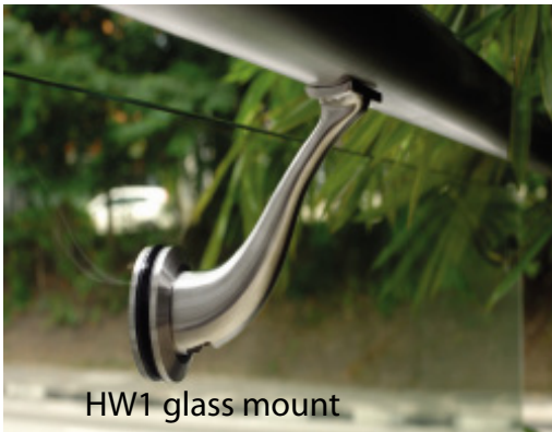
HW1 glass mount