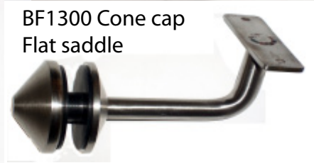
BF1300 Cone cap Flat saddle