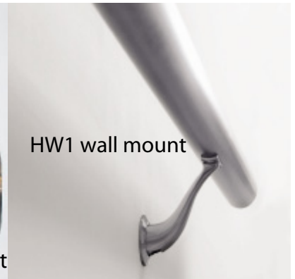
HW1 wall mount