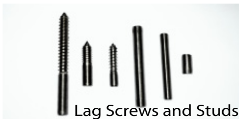
Lag Screws and Studs