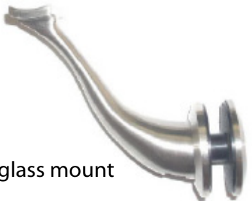
HW1 glass mount